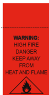
High fire hazard label